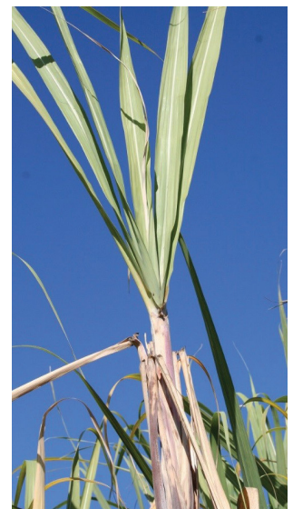
▲ Figure 2. Compressed leaf whorl and shortened leaves in MODDUS-treated cane.