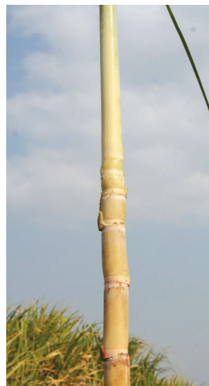
▲ Figure 1. Inhibition of internode elongation at the top of a MODDUS-treated stalk.

When cane quality is at a peak following prolonged slow growth during winter, this chemical can also be used for late-season quality maintenance (typically crops harvested in November – December under South African conditions).