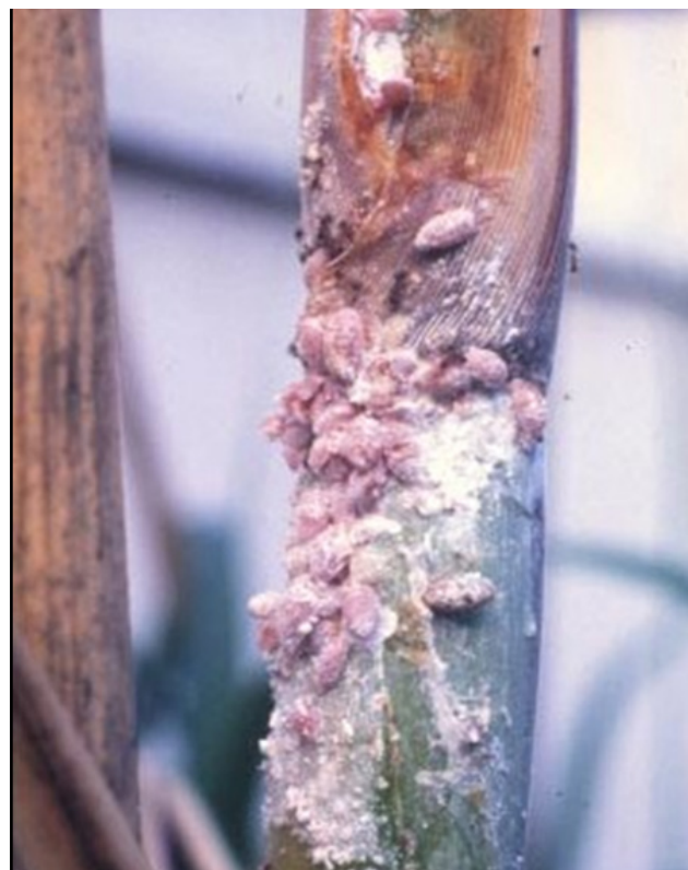
▲ Figure 4. The mealybug Saccharicoccus sacchari on sugarcane.

Males are rare and the females can produce fertile eggs without mating. The eggs hatch within an hour of being laid and the fairly active nymphs migrate upwards towards the young joints of the stalk. As they grow bigger, they become less active, because their legs do not develop in proportion to their bodies. Thus, adults are almost sedentary.