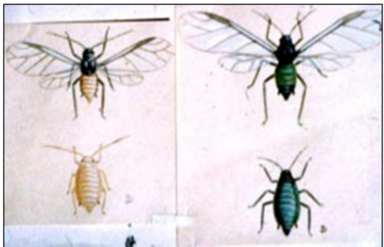
Figure 1. Adult (winged) and young stages of sugarcane aphids Melanaphis sacchari (left) and Rhopalosiphum maidis (right). ►

These are winged or wingless aphids which have a life history similar to that of Melanaphis sacchari . They are distinguished from the latter by their larger size, their dark green colour and the dark areas around the base of the abdominal horns (Figure 1).