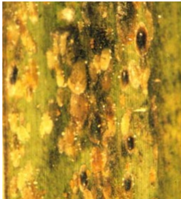
▲ Figure 5. Magnified image of sugarcane leaf showing soft scale (oval structures).

Natural biological control has been effective for many years. It is thought that local outbreaks have been caused by a breakdown in this natural control, which may reassert itself in due course. At this stage no recommendation for the use of insecticides has been formulated.