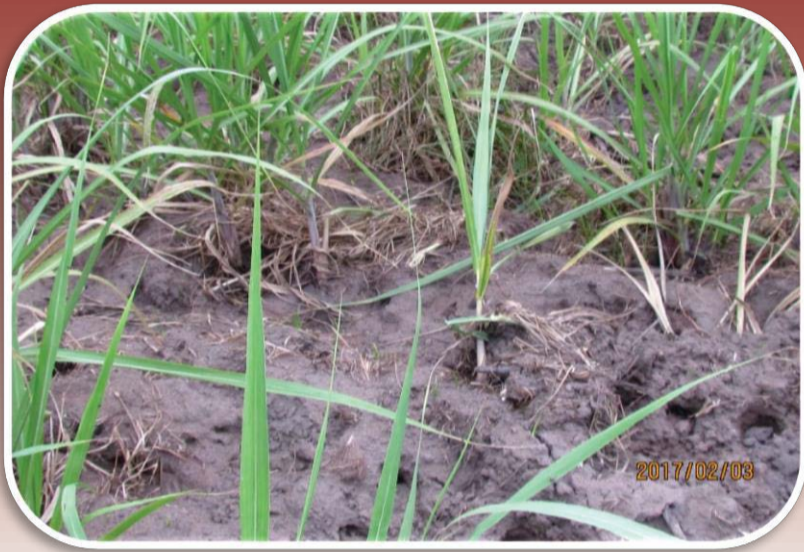
Pig damage may indicate presence of larvae

The Longhorn Beetle poses a real threat to sugarcane in South Africa. Your assistance is requested to look out for this pest as illustrated below.