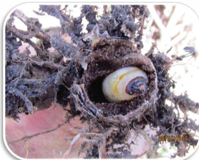
Larva in base of stalk