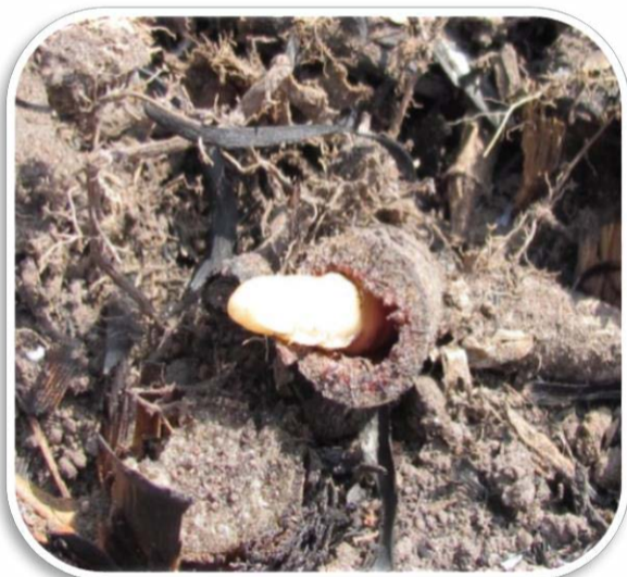
Larva in cane stubble