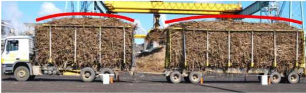
Figure 2. “Bread loaf” loading  .