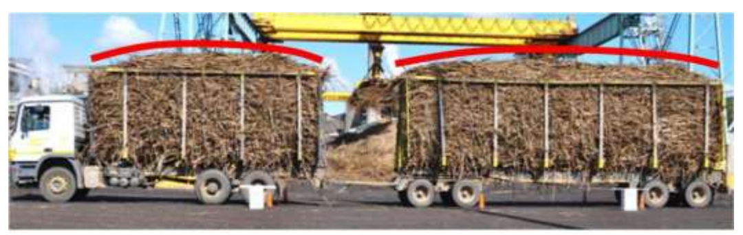
Figure 2. "Bread loaf" loading .