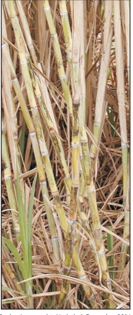
Updated by Sanesh Ramburan (Senior Agronomist: Varieties) December 2014