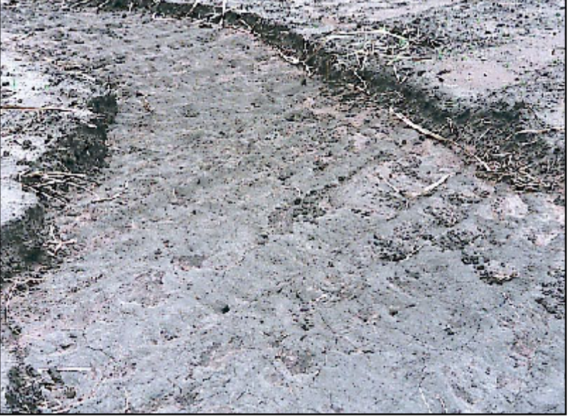
The beginning of erosion caused by soil compaction.

• A primary cause of soil salinisation is the development of high water tables, which allow