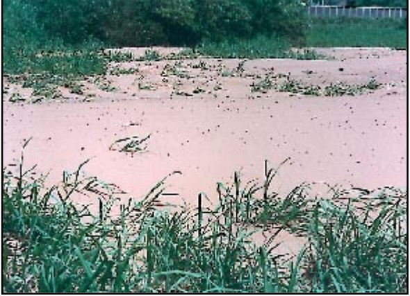
The result of a heavy downpour: soil deposition from a fallow field upslope.