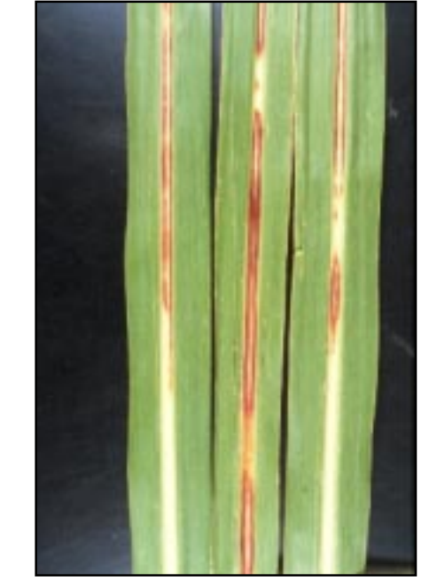
Figure 2. Midrib lesions occur following insect damage.