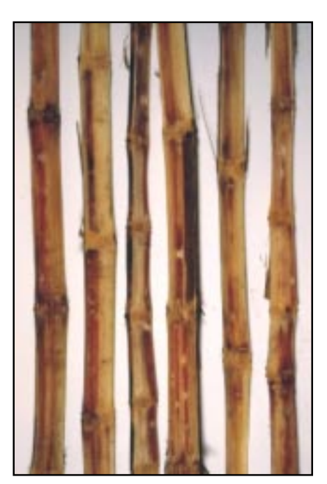
Figure 1. Stalk symptoms of red rot.

The fungus produces spores which are spread by wind, rain and irrigation water. Infection takes place through wounds in the stalk, such as insect borings, growth cracks and damage by implements, or at the buds.