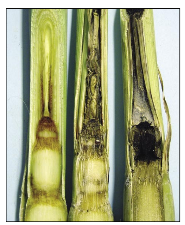
Figure 1. From left to right: Three stages of damage to the growing point - slight damage, severe damage, and severe damage where the growing point is dead.

The degree of damage from frost can be evaluated by inspecting the leaves, apical meristem and lateral buds. The apical meristem (or growing point) can be checked by splitting the plant lengthwise (Figure 1). The lateral buds become visible when the leaf sheath is removed. Frost damage occurs from -2°C, where sugarcane growth is affected only slightly, to -9°C,