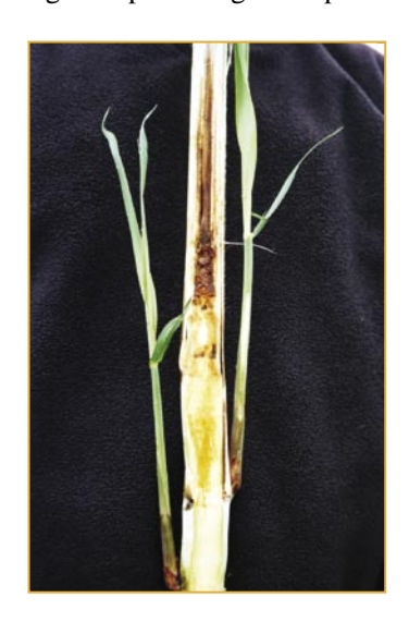
Figure 3. Side-shoots will form if frost kills the growing point. Side-shoots can increase leaf area and may contribute significantly where the crop is carried over.

Bear in mind that cane only becomes millable after about 8 months of age, depending on the growing season, and becomes economical to harvest after about 9 months of age, depending on the RV price. If in doubt, it is better to mill frosted cane and allow the ratoon to regrow during the optimum growth period.