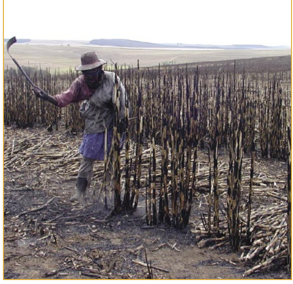
Short cane should not be topped higher in order to facilitate better bundling. The frosted portion of the stalk and leaf sheaths (above the meristem) will have a negative RV.