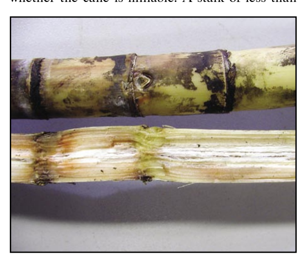
Figure 2. An example of rapid deterioration of the stalk where the growing point, leaves and buds have been killed by frost. Such cane should be harvested as soon as possible after the frost.

Frosted cane should be managed according to the degree of damage experienced. The first issue to consider is the length of stalk, in order to determine whether the cane is millable. A stalk of less than