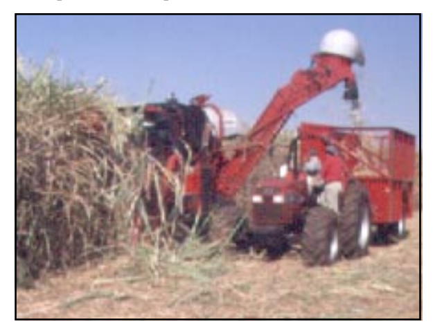
A chopper harvester operating under ideal field conditions.

An important factor affecting chopper harvester performance is the number and capacity of the infield haulage units, and the distance that these units have to travel to the transfer station or transloading site. Optimum harvester performance can only be achieved when the harvester is not held up by a lack of infield transport. This means that an adequate number of infield haulage units should be available when required and that infield haulage distances must be kept as short as possible.