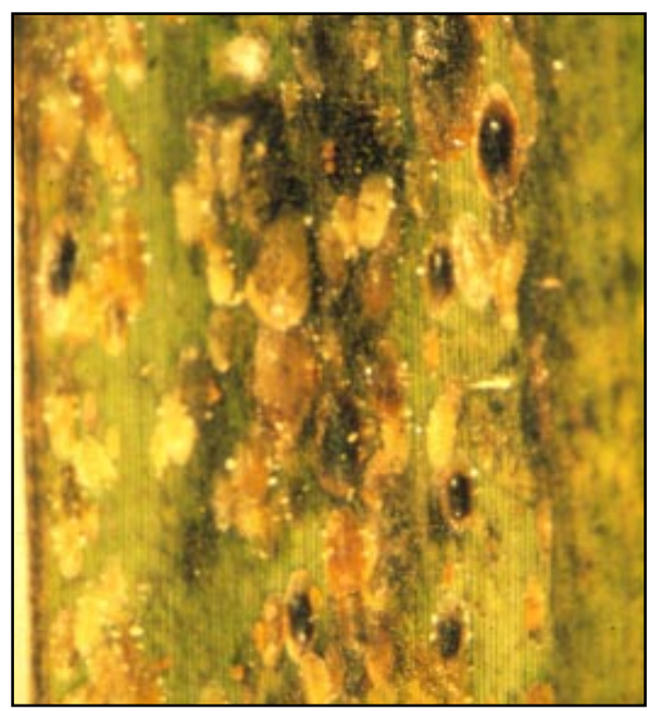
Figure 5. Magnified image of sugarcane leaf showing soft scale (oval structures).

Natural biological control has been effective for many years. It is thought that local outbreaks have been caused by a breakdown in this natural control, which may reassert itself in due course. At this stage no recommendation for the use of insecticides has been formulated.