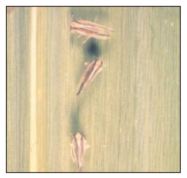
Figure 3. The plant hopper, Perkinsiella saccharicida.

Both adults and nymphs are sap feeders. Adults are more active and can disperse by short flights from plant to plant. Often, when disturbed, the adults do not fly