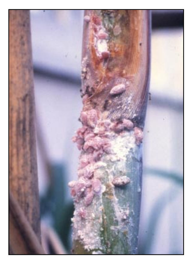
Figure 4. The mealybug Saccharicoccus sacchari on sugarcane.

The adult scale does not move around, and dispersal is by the young first stage nymph. Dispersal is by crawling from one leaf to another or, more effectively, being blown by wind. The female attaches herself to the underside of leaves and feeds on the phloem sap.